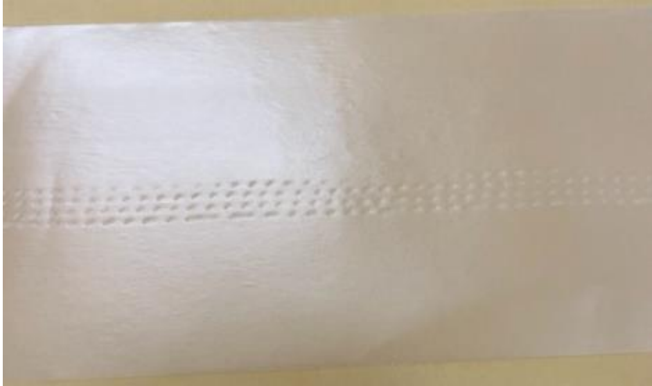
Two Layers into Roll